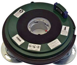
Planetary Head K1500 included