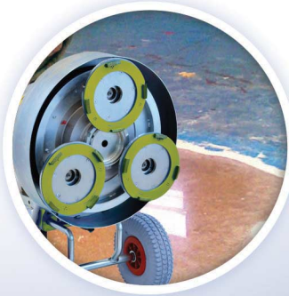
GRINDING EPOXY PAINT OFF ON CONCRETE