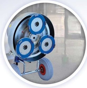
GRINDING & POLISHING CONCRETE