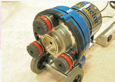
Diamond Brush System for Levighetor