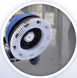
FLOOR CLEANING WITH SOFT BRUSHES