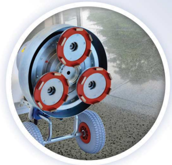
GRINDING & POLISHING TERRAZZO