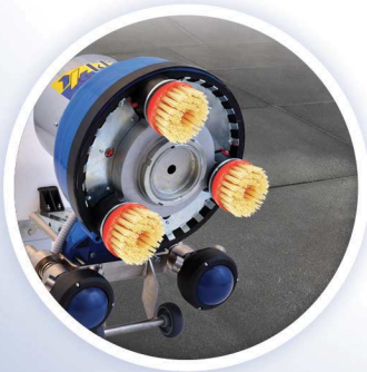
DIAMOND BRUSH FLOORING FOR ANTI-SLIP FLOORING