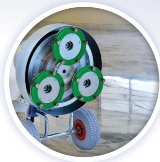
GRINDING & POLISHING MARBLE